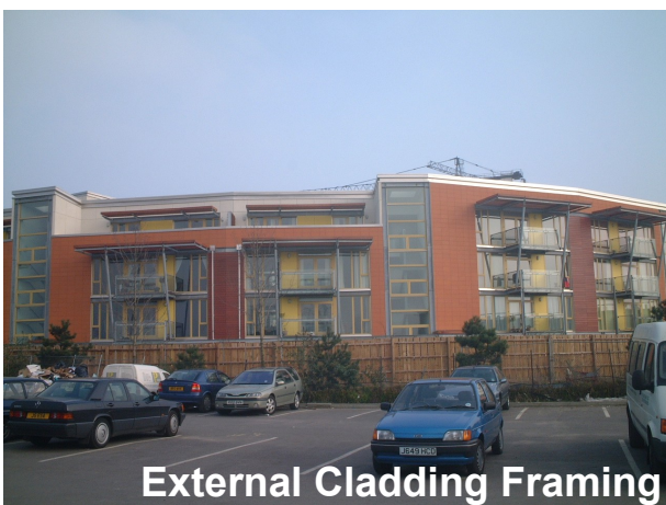
External Cladding Framing