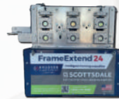
FE24 TELESCOPING FRAME FORMERS