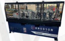
K35C ACCESSORY SHAPE CASSETTE FORMERS