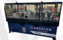
K35C ACCESSORY SHAPE CASSETTE FORMERS