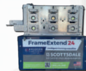
FE24 TELESCOPING FRAME FORMERS