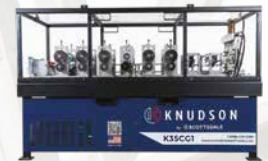
K35C ACCESSORY SHAPE CASSETTE FORMERS