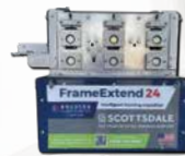
FE24 TELESCOPING FRAME FORMERS